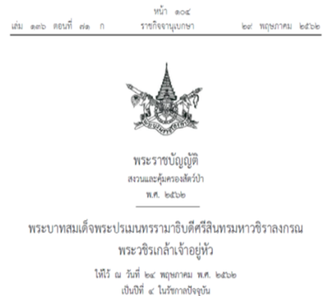
Thailand Wildlife Conservation and Protection Act, B.E. 2562 (2019)